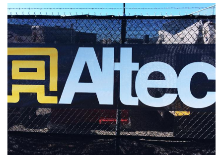
Stitch On Logos