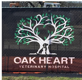
Direct Print Logos