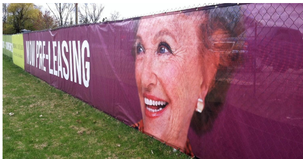
Full Color Digital Printing