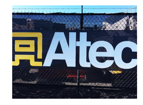
Stitch On Logos