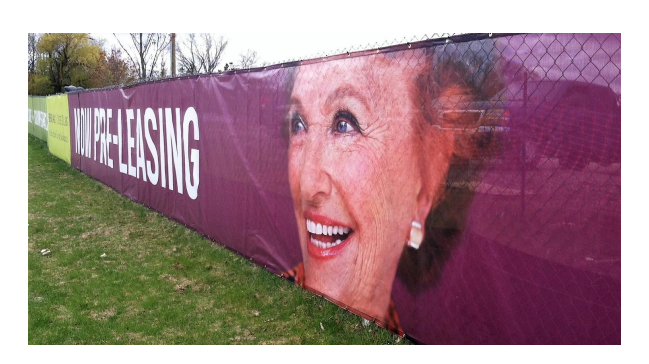
Full Color Digital Printing

► Fabrication: Four ply, reinforced hems on all sides with #2 brass grommets placed in 18" intervals