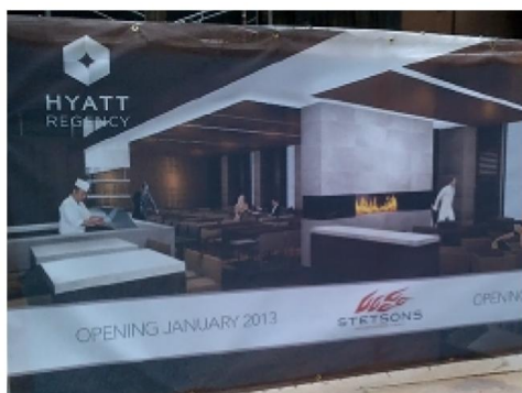
Digitally Printed Logos