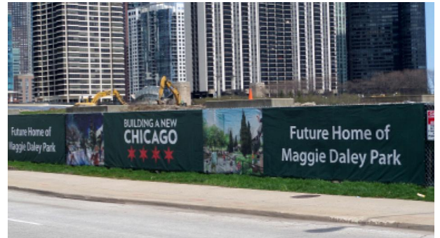
Permascreen 70 with full-color digital painting