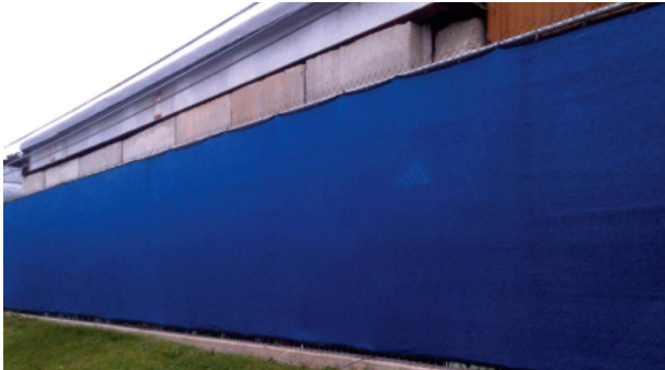
Construction 85 in Royal Blue