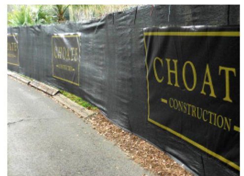
Sewn On Logos

CALL US FOR A QUOTE 800.594.0744 VISIT US ONLINE MIDWESTCOVER.COM