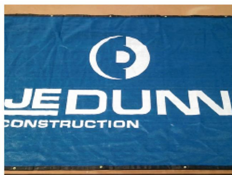
Direct Print Logos